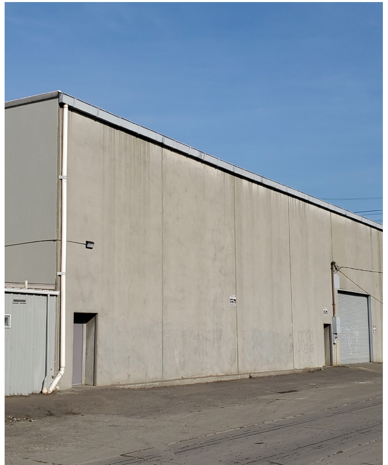
Open Entrance Area

Many new businesses nearby with a variety of other strong manufacturing, design, and service offerings