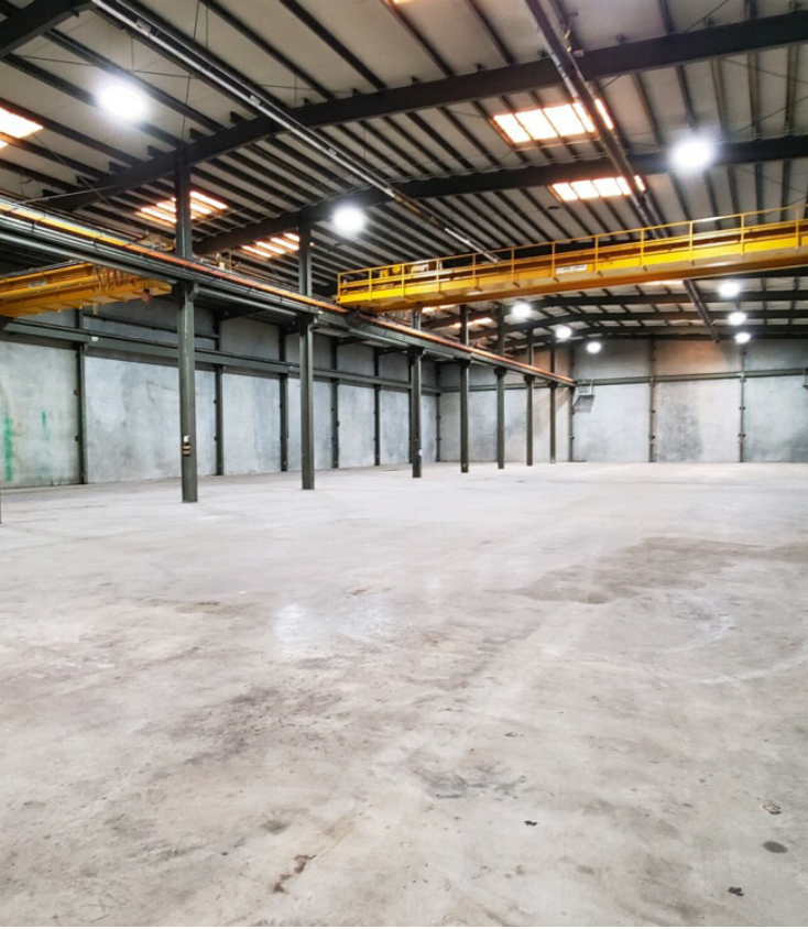
Seattle Industrial District Space